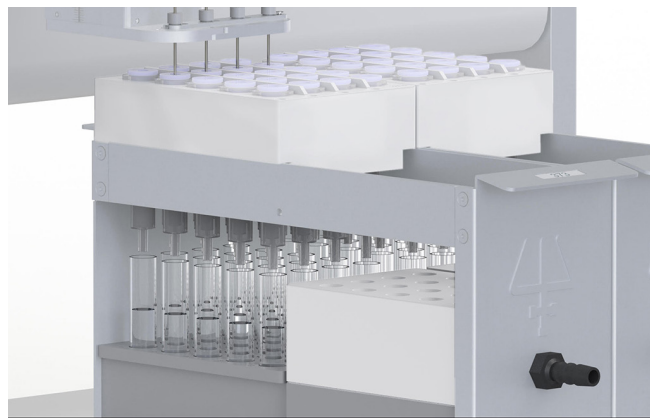
Figure 2 The system is equipped with four probes, permitting four samples to be processed simultaneously with automated solid phase extraction.